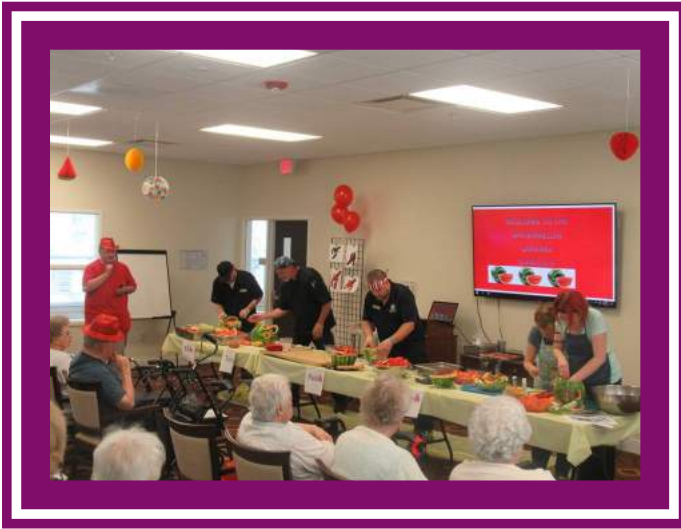
Our Annual Water Melon Carving Contest