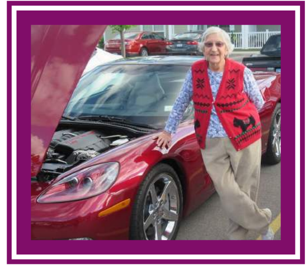
Car Show 2018