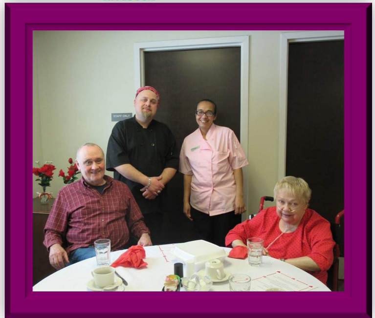
All our Couples were treated to a Special luncheon that the Chefs prepared just for them for Valentines Day!