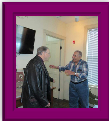
Our trip to the Nash Museum in Buffalo proved to be a wonderful wealth of Buffalo history.